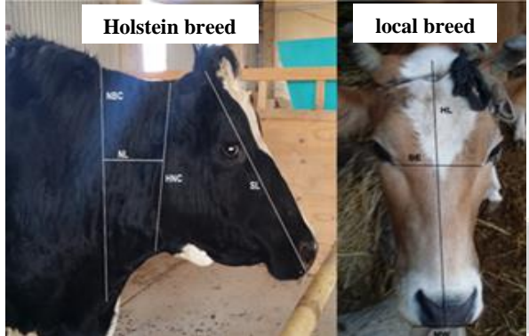
Figure (1): Shows the parameters traits (HL: head length; BE: line between the medial canthi of the eyes; SL: the head side length; HNC: head-neck collar; NBC: neck-body

The animal model choose for this study was (140) Holstein Friesian breed and 140 of local breed cows, their ages was (48\pm4) months.