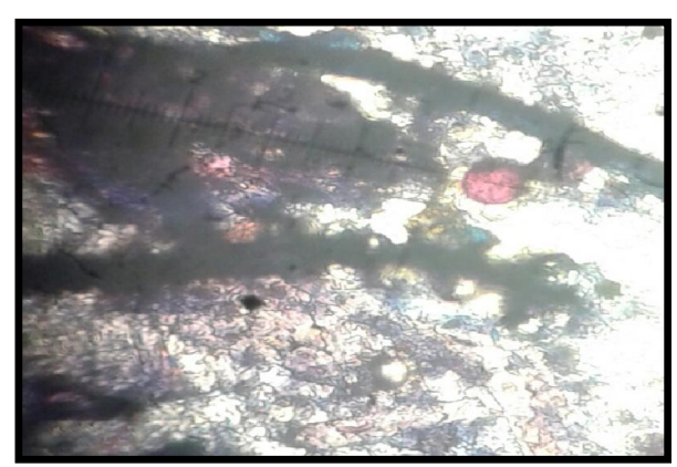
Fig(3) Cryptosporidumspp (X40)

The second genus from parasitic protozoan that has been recorded in this study is the Cryptosporidium spp. , the number of infected animals reached 13 (20.63%) fig (3).