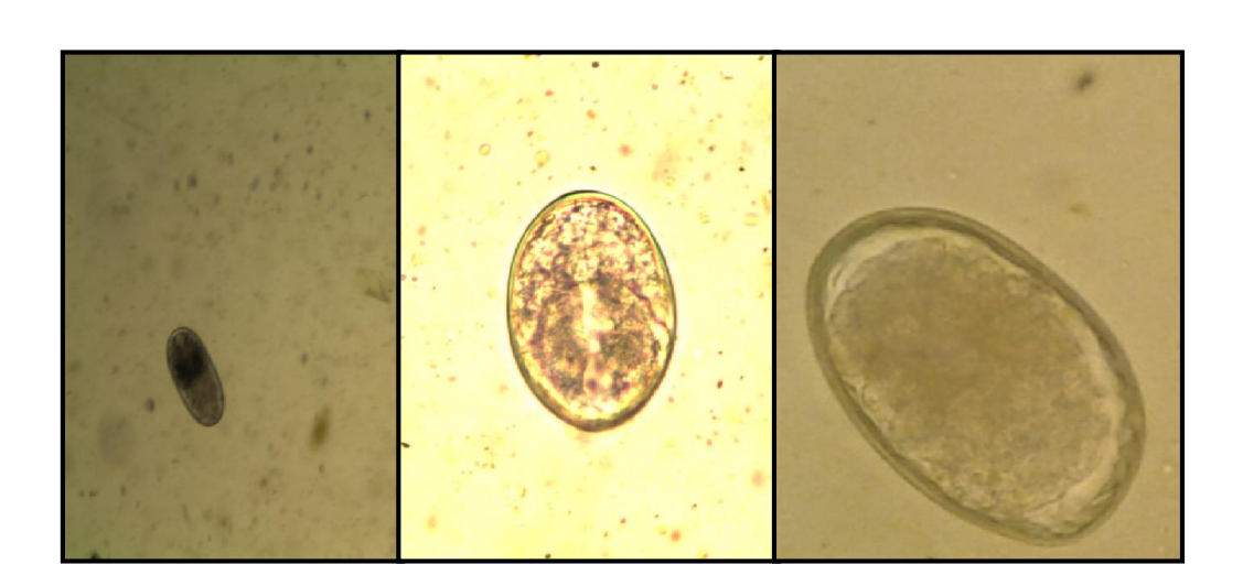
Fig (7,8,9) Trichostrongyldae eggs

The present study recorded infected the animals by Trichostrongyldae the number of infected animals 12 by percentage reached to (7.56%) fig (7,8,9).