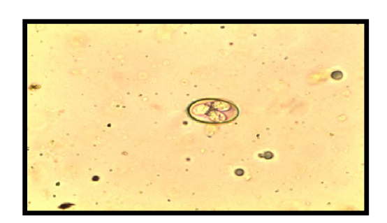
Fig (2) E.brasilenisis ( X40 )

The second genus from parasitic protozoan that has been recorded in this study is the Cryptosporidium spp. , the number of infected animals reached 13 (20.63%) fig (3).