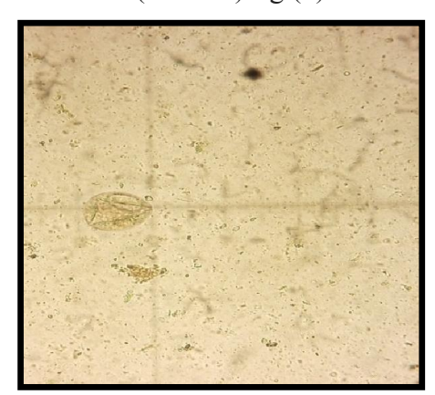
Fig (4)Moneziaspp (X40)

The present study also recorded infected buffalo with Moneziaspp terms of the number of infected animals was 2 (1.26%) fig (4).