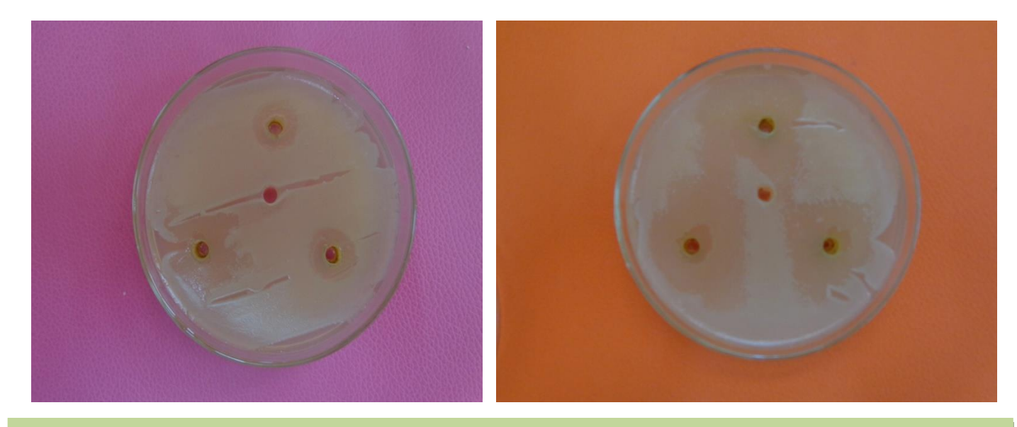
Figure 3 : [A]: Inhibitory activity exhibited by celery seeds extract (200 mg/ml) against E.coli in culture media; [B] : Inhibitory activity exhibited by peppermint leaves extract (200 mg/ml) against E.coli in culture media.