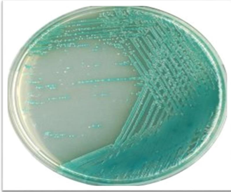
Figure(1). Pseudomonas aeruginosa colonies produced pyocyanin (bluegreen pigment) on orientation chrom agar.