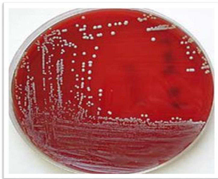
Figure(2). Pseudomonas aeruginosa colonies on blood agar